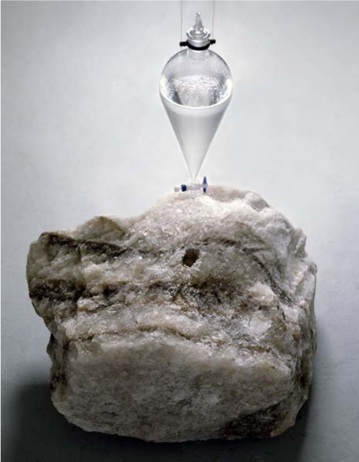
Negative Ions I , 1996, rock salt, 16 x 24 x 20 inches