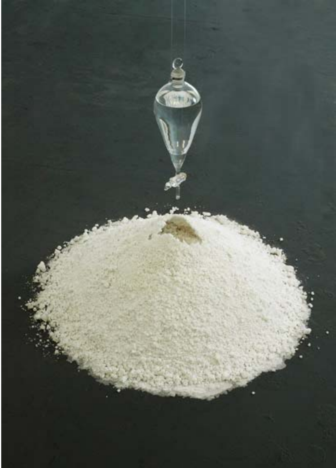
Antarctica Six Continents , SolwayJones Gallery, 2005