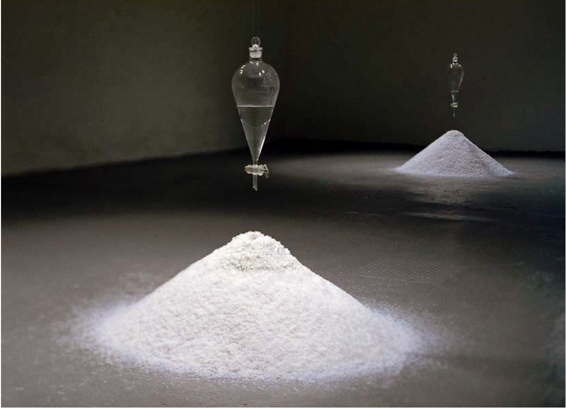
Negative Ions II 1996 Stalke Gallery, Copenhagen, 2001