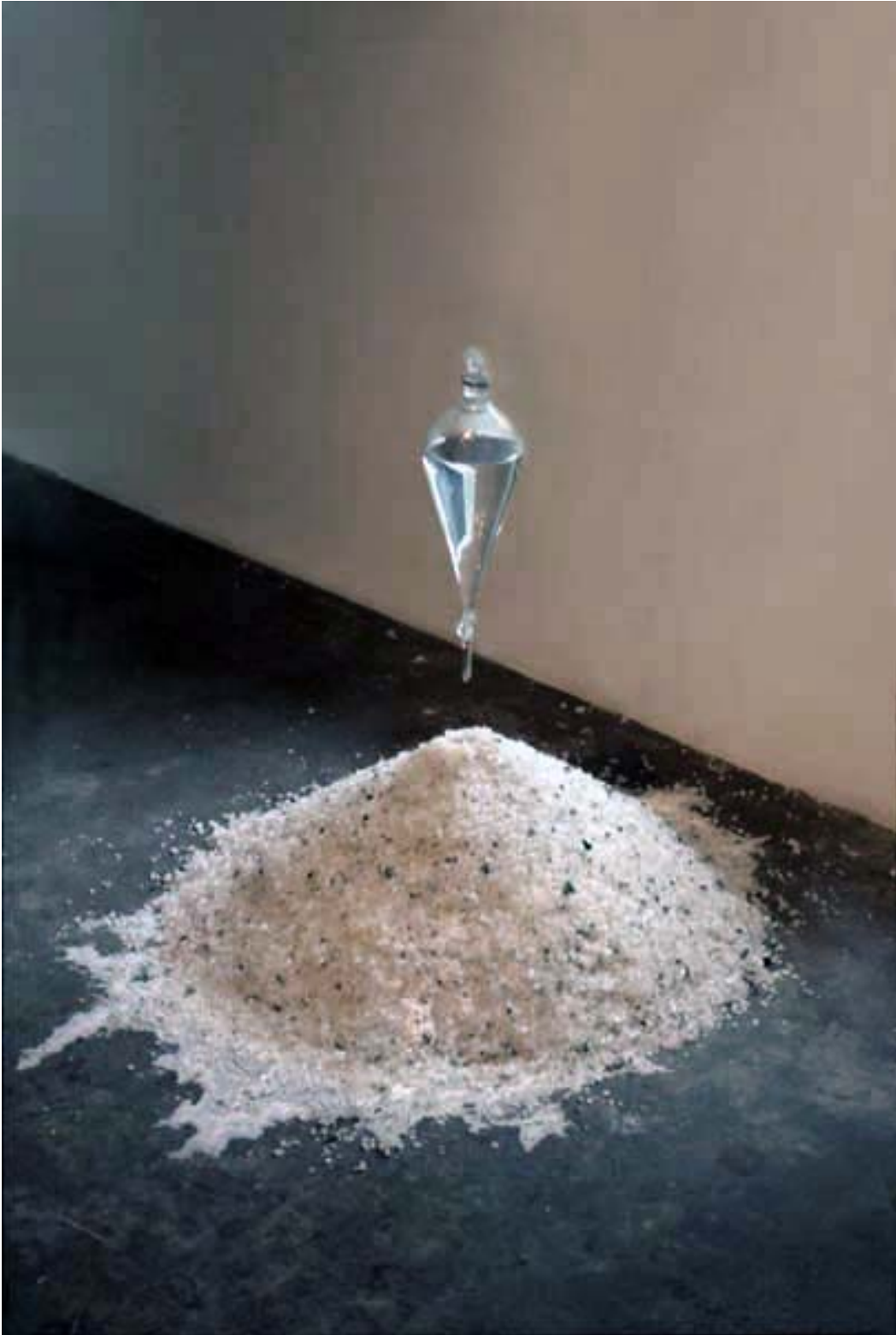
Negative Ions II Volume Gallery, New York, 2004