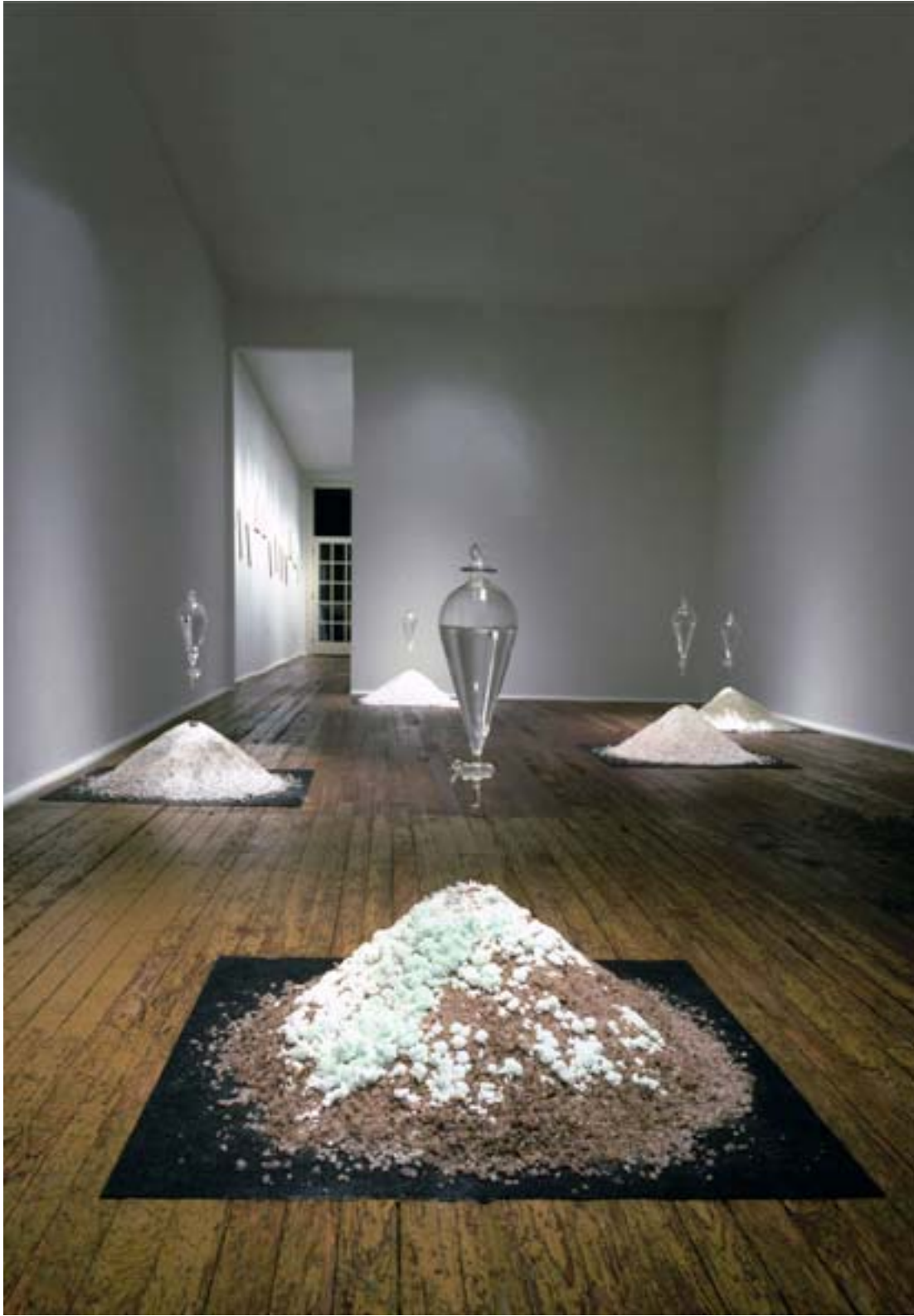
Six Continents , 2003 Larry Becker Contemporary Art, Philadelphia, 2005