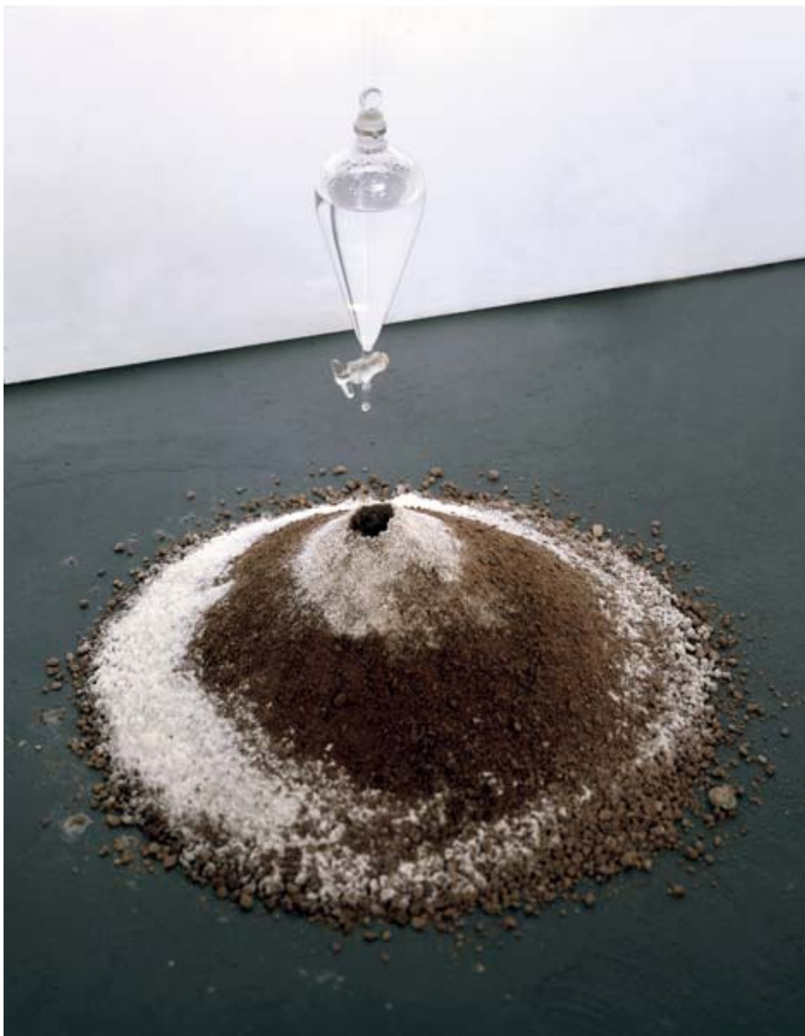
Eurasia Six Continents , SolwayJones Gallery, Los Angeles, 2005