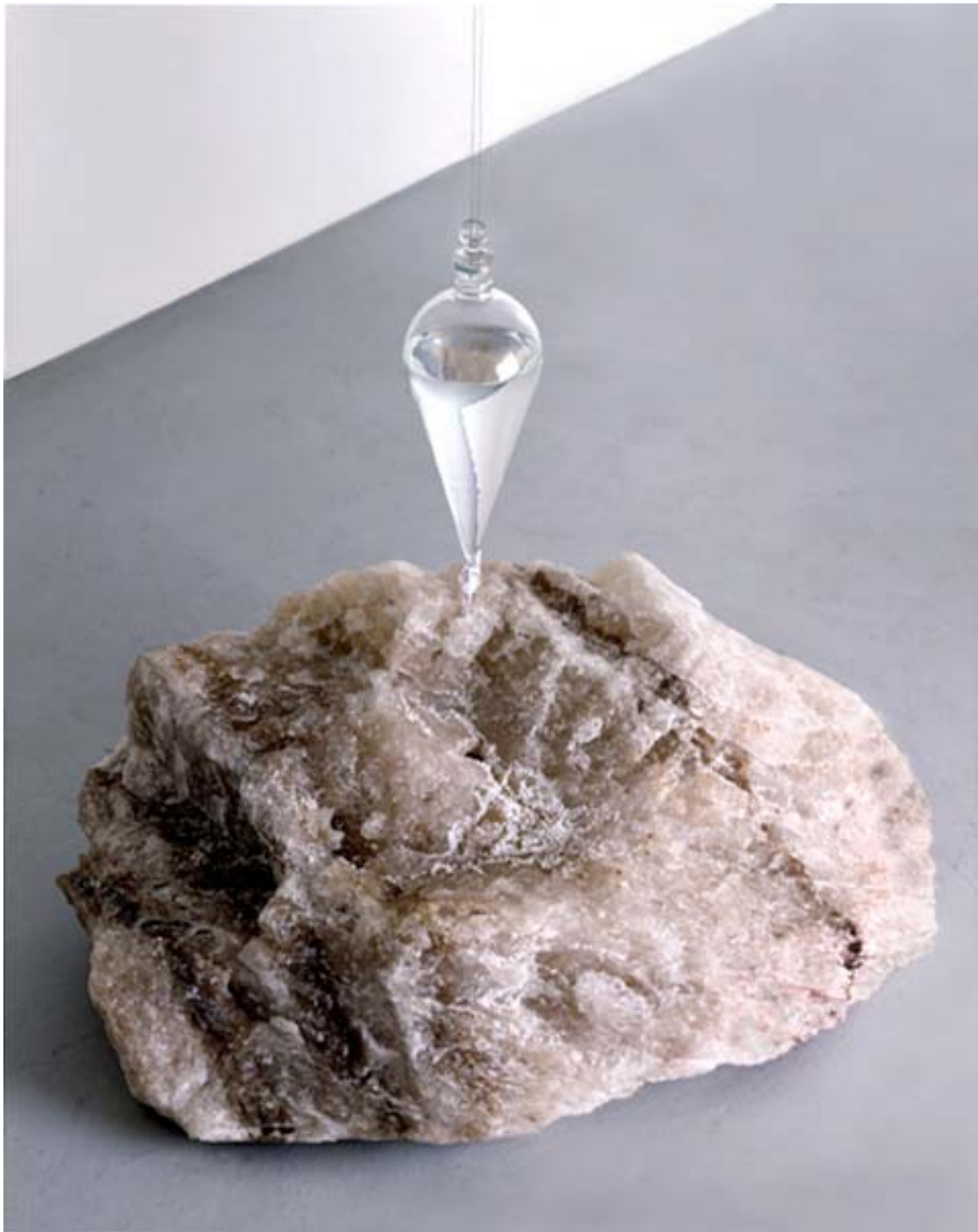
Negative Ions I , 1996, rock salt, 18 x 32 x 27 inches