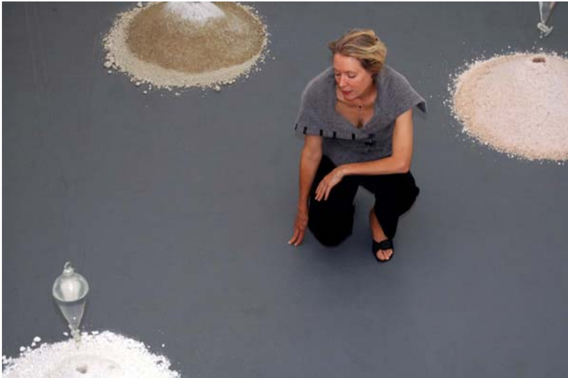
Dove Bradshaw Six Continents , SolwayJones Gallery, Los Angeles, 2005