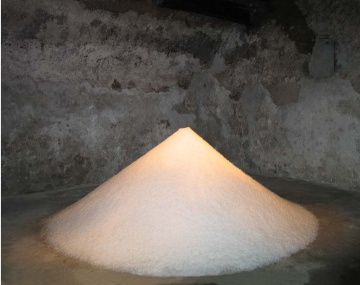
Negative Ions II 1996 Senzatitolo, Rome, 2007