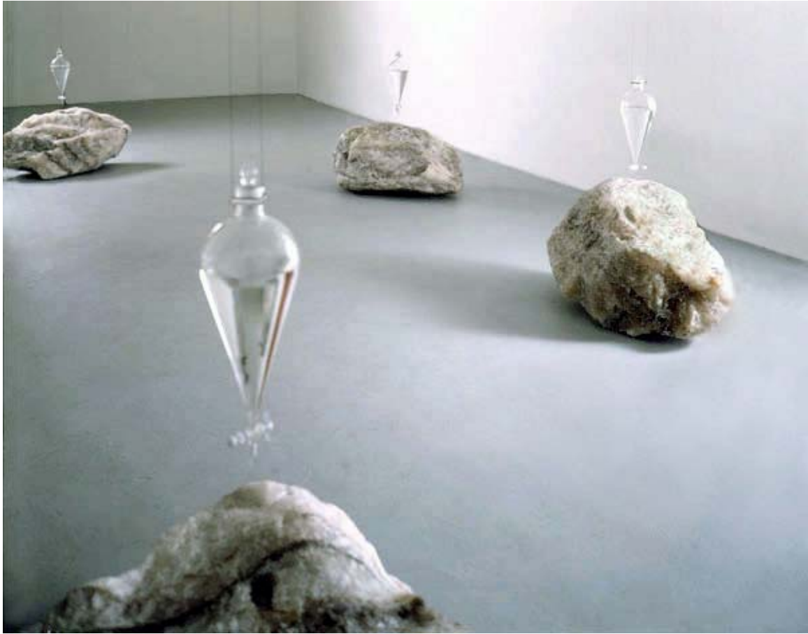
Negative Ions I 1996 Sandra Gering Gallery, New York, 1998