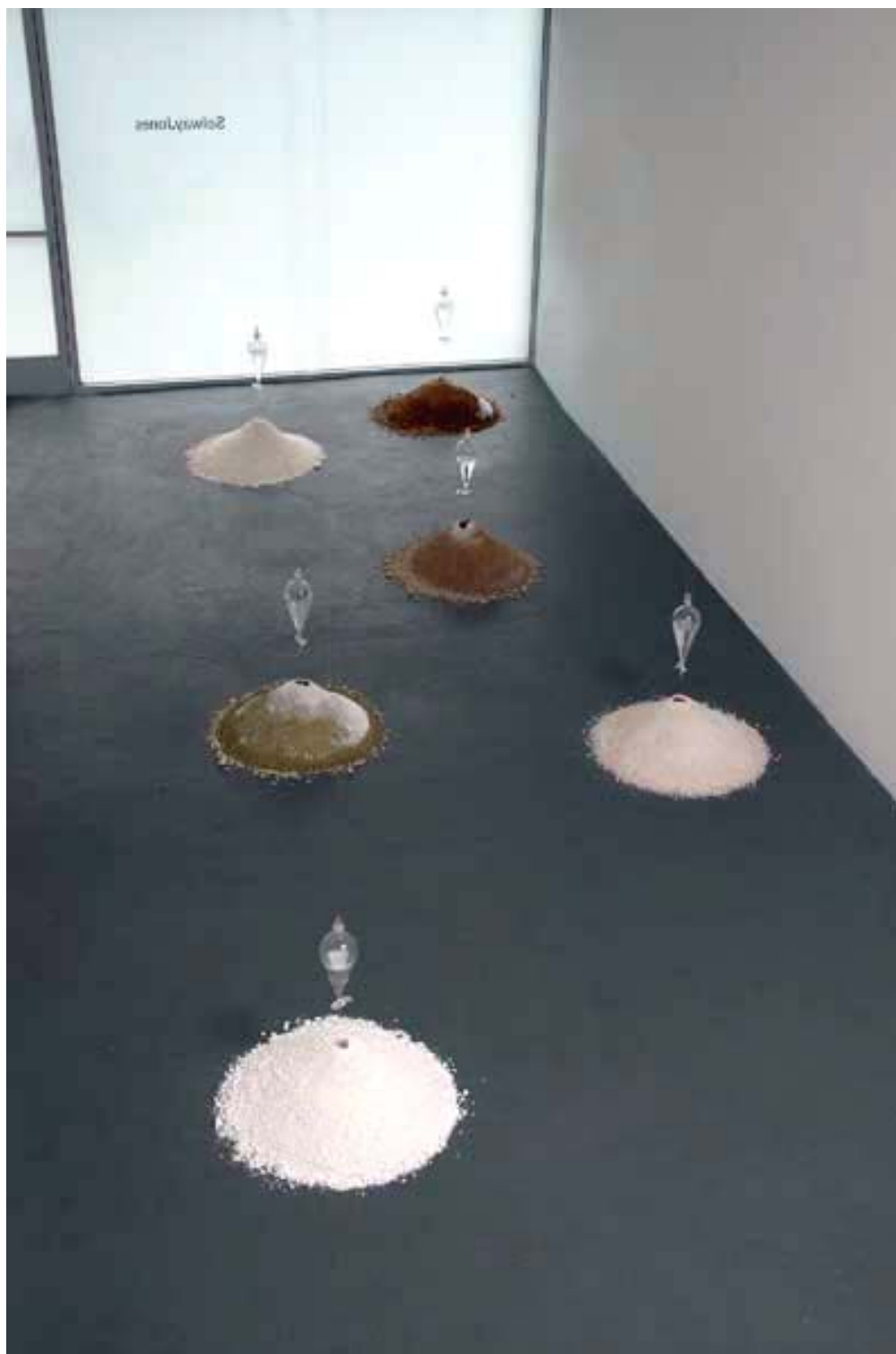
Six Continents SolwayJones Gallery, Los Angeles, 2005