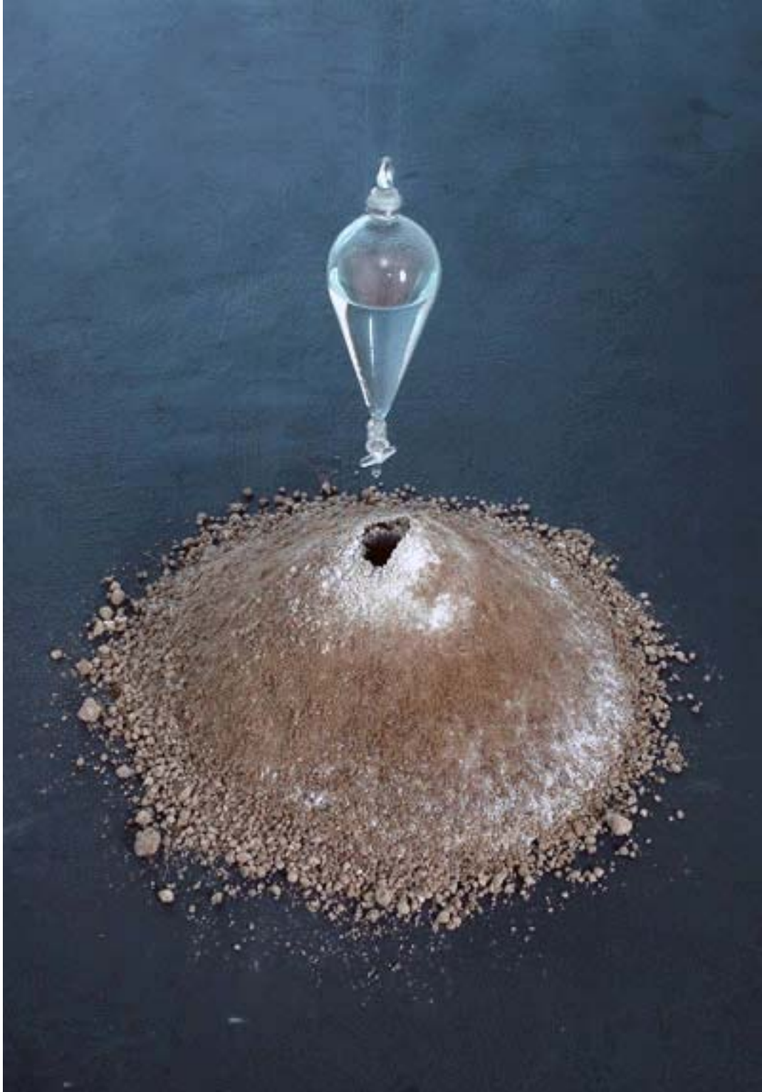
Africa Six Continents , SolwayJones Gallery, Los Angeles, 2005