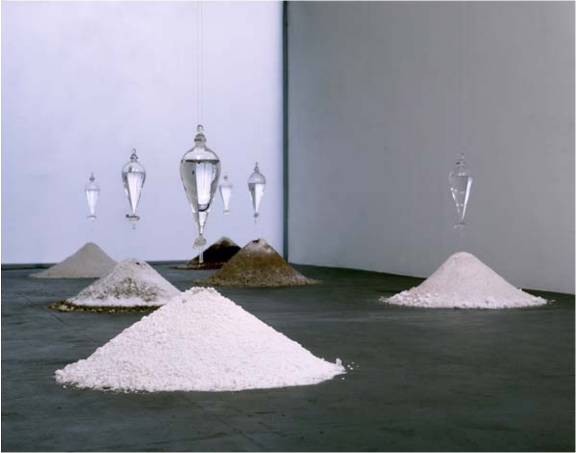
Six Continents 2003 SolwayJones Gallery, Los Angeles, 2005