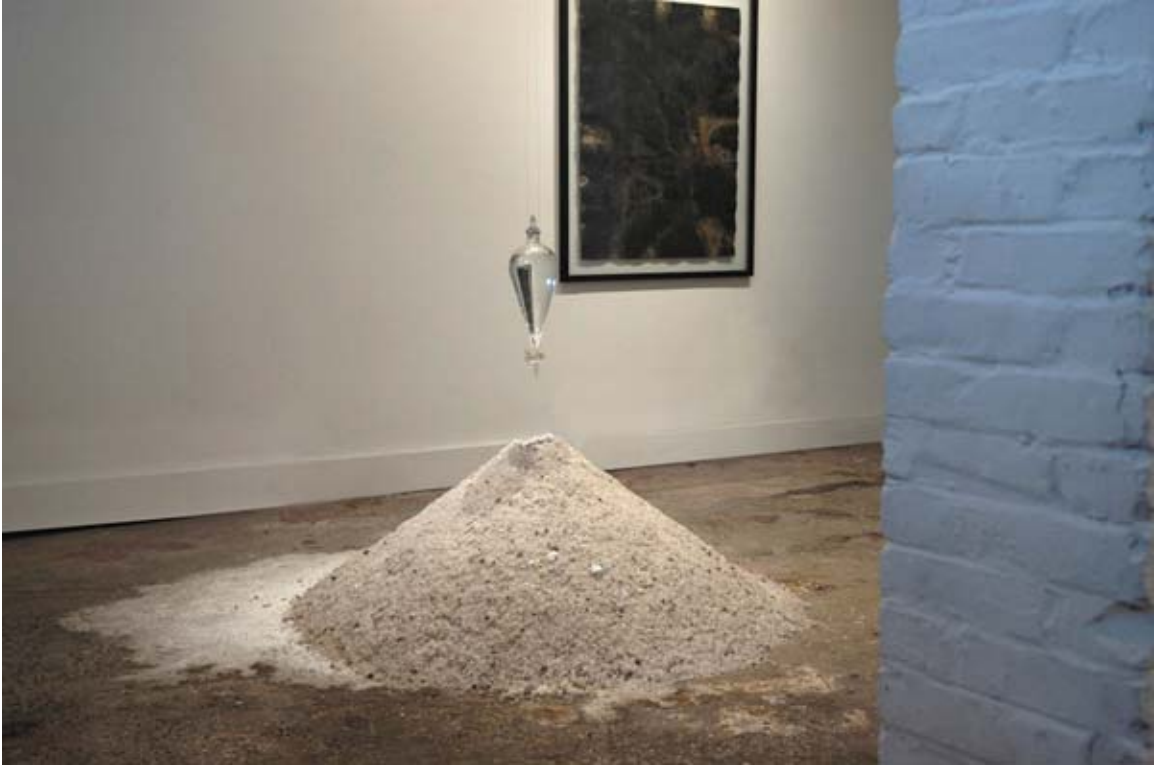
Negative Ions II 1996 Pierre Menard Gallery, Cambridge Massachusetts, 2008