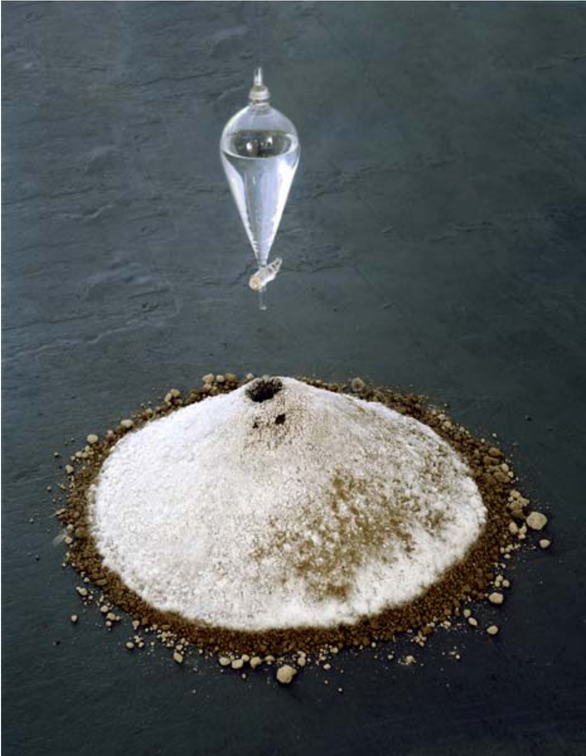
North America Six Continents , SolwayJones Gallery, Los Angeles, 2005