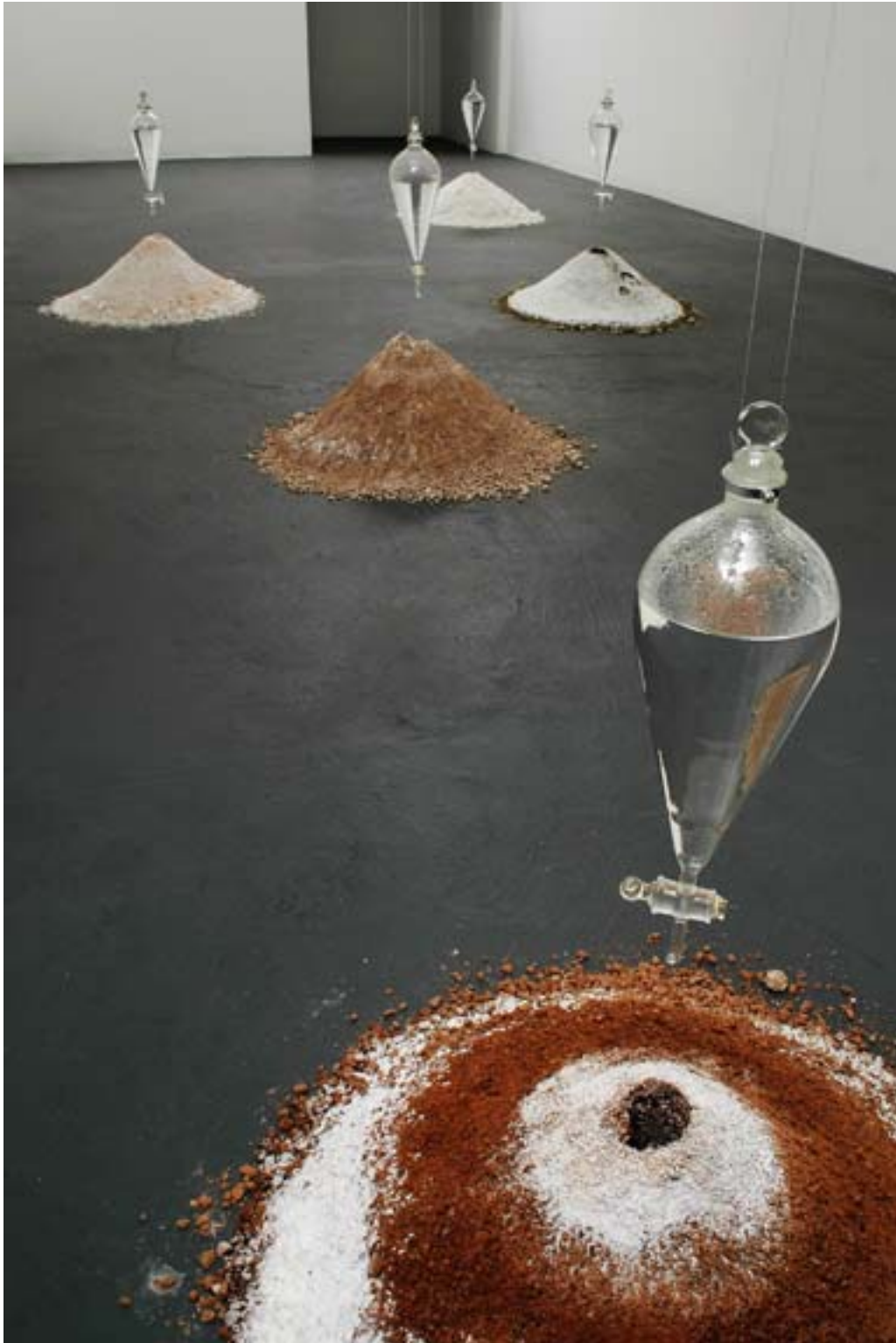
Six Continents , 2003 SolwayJones Gallery, Los Angeles, 2005