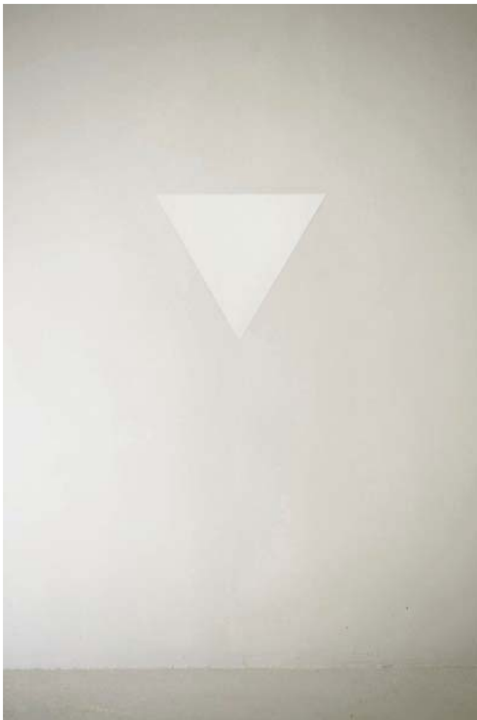
Dove Bradshaw Zero Space, Zero Time, Infinite Heat, 1988 Plaster, 21 ¼ inches each side