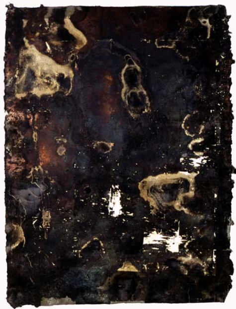
Dove Bradshaw, Contingency, 1985, Silver, liver of sulfur on paper, 32 x 24 inches

Instructions for changing installation at the mattress factory