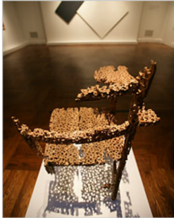
Tom Friedman Chair (2001-2)

Unlike the sleek white boxes of Chelsea, the town house galleries of the Upper East Side tend to be small, old and charmingly idiosyncratic. Wooden floors creak, antique moldings and multiple doorways eat up wall space, and ghosts of residents past lurk in the shadows.